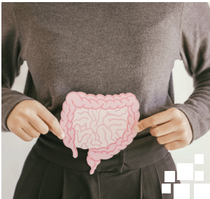
Importance of Gut Health