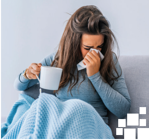
Flu Season in Australia